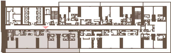
48TH TO 49TH FLOOR